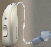
RIE 13 battery