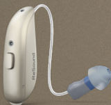
RIE 312 battery