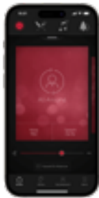
ReSound Smart 3D app

ReSound Smart 3D app Use the ReSound Smart 3D app on your mobile device to adjust the volume of your hearings aids or change programs to focus on what you want to hear.