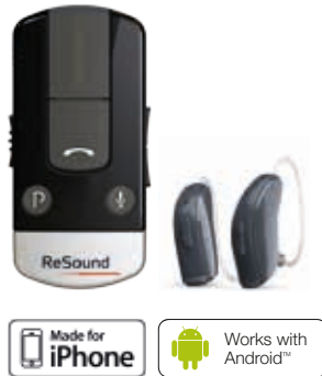
Wireless connectivity with the ReSound Unite Phone Clip+.