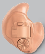
CROS B-13 Custom