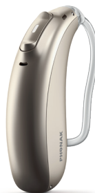
Bolero M-PR Available Fall 2019